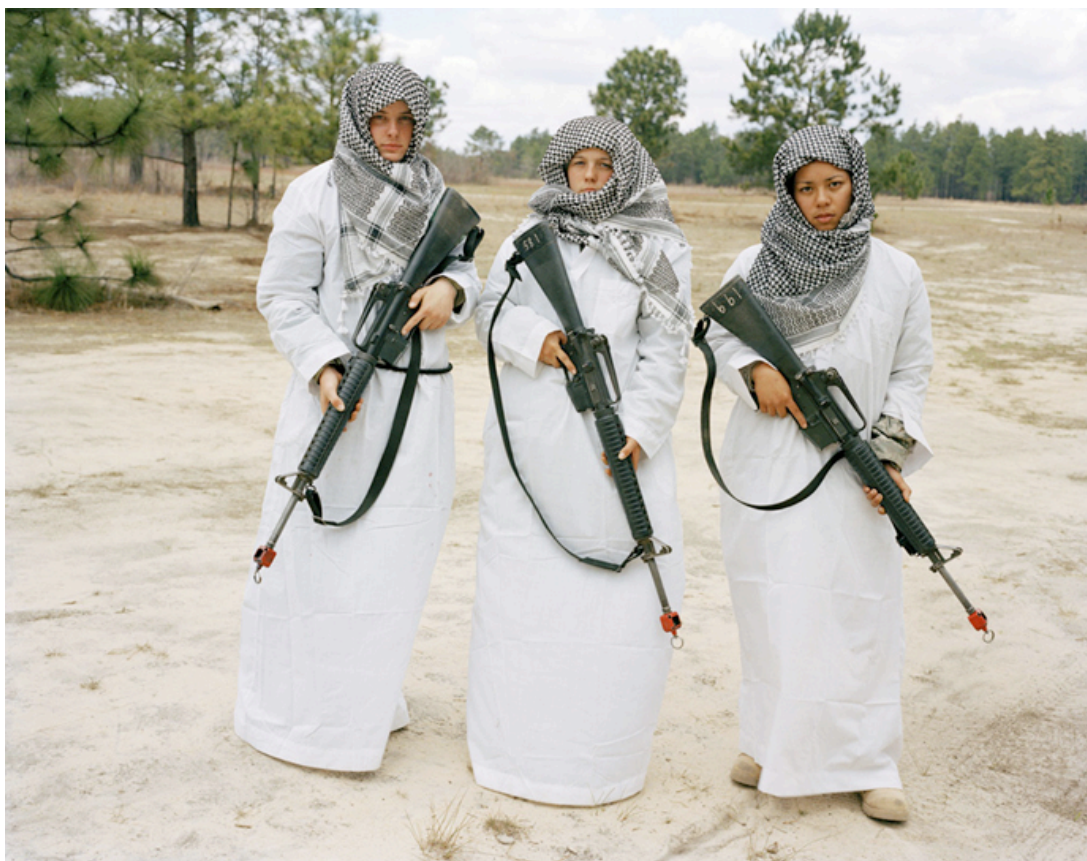
Soldiers As Villagers , Fort Jackson, South Carolina, 2006 — from the series In Training

Photo © Claire Beckett — featured in EXPOSURE: The Annual PRC Juried Exhibition